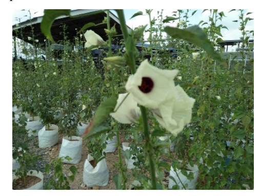
Fig. 1. Kenaf plant

harvesting machine when the kenaf plant reaches maturity at 3-5 meters in height. The separation machine is used to separate the core of the kenaf shaft from the exterior, which then undergoes a retting process to separate the long fibers from impurities. The fibers are then dried and stored for sale.