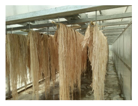
Fig. 3. Kenaf fibers in the drying chamber

Weight was measured using a digital scale with a maximum load of 300 kg and an accuracy of \pm 0.1 kg. Drying time was recorded on a digital timer. Water content was measured using the oven technique. Each sample was heated at a temperature of 100°C for 24 hours to obtain the weight of the dry solids. Energy consumption was measured using a kilowatt-hour meter. The meter had an accuracy of 0.1 kWh and an accuracy range of \pm 0.05 kWh. Electricity costs were estimated by referring to the electricity tariffs of Malaysia's National Energy Corporation at 0.390 RM/kWh (0.094 USD/kWh) for the first 200 kWh and 0.472 RM/kWh (0.11 USD/kWh) for each additional kilowatt-hour. Figure 3 shows the kenaf fibers hung in the chamber for drying