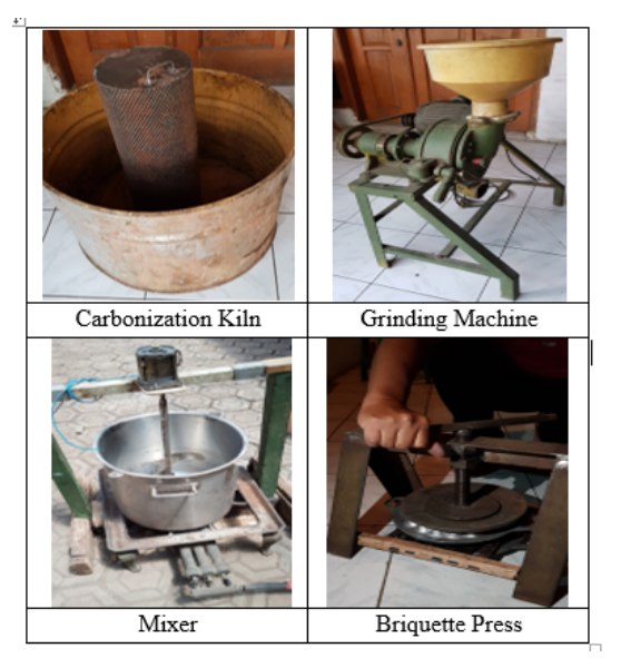
Fig. 1. The equipment used.

The equipment consists of Carbonization kiln, which is a simple drum with perforated fire tube in the center, Grinding machine, Mixer, and Briquette press machine, as shown in Figure 1.