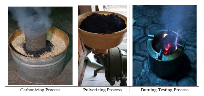
Fig. 2. The process of briquetting and testing.

Currently, the currency conversion unit of 1 US $ = IDR 14,000. Therefore, the "net worth" for the micro industry is equivalent to US $3.572 and the "annual sales result" equivalent to US $21.428. The average current selling price of corn briquette is IDR 6,000 or US $0.428/kg. Therefore, to reach the annual sales result of US $21.248, the necessary production of briquette is 50,000 kg/year.